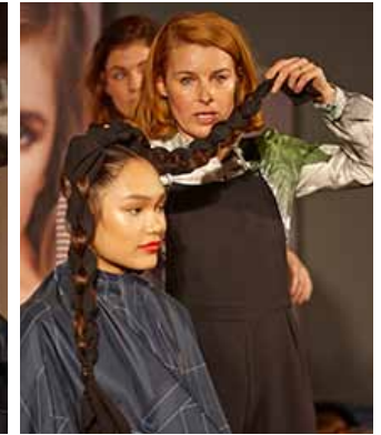
Looks, where the fabric is braided into the braids to make the look more raw.