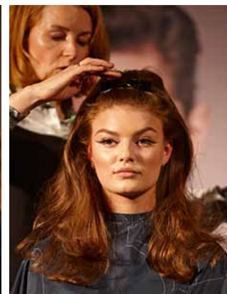
The lolita-inspired glam look was used during the Birger Christensen fashion show, as it was in fine contrast to the animal furs.

The hairdressers were also introduced to the two looks 'Micro Bang' and 'Buzz Cut'.